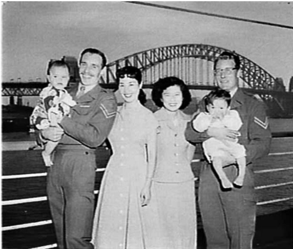
Fig. 1: Australian servicemen and their Japanese wives, Sydney 1956.